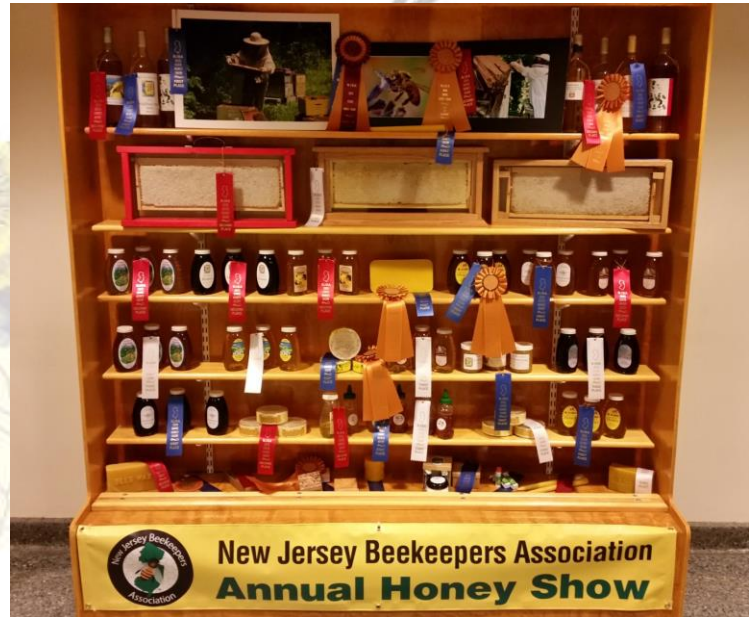
More entries and winners