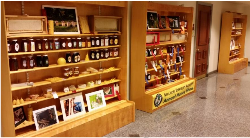
All 3 display cases