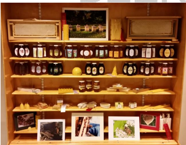
The winners (at least the ones which fit)